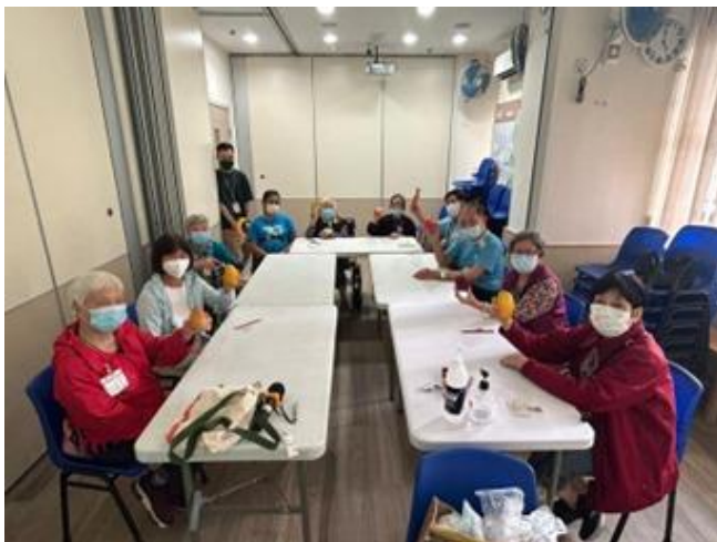
Cognitive training at Day Care Centre

Each beneficiary received 15 sessions of 1.5 hours cognitive training conducted at the Mind Delight Memory and Cognitive Training Centre or one of the elderly centres operated by other NGOs. Some of the training was conducted online due to the COVID-19 pandemic. There were 42 beneficiaries and the total service hours amounted to 945.